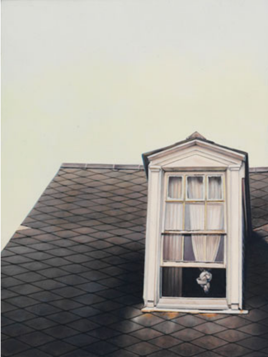
Heather Marshall, Beyond the Knot , 2010, Oil on Panel, 8" x 6"